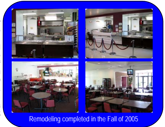
Remodeling completed in the Fall of 2005

In addition to serving the County employees and the public, the Cafeteria staff, which consists of eight fulltime employees, currently serves over 250 inmates, three meals per day, 365 days a year AND 400 meals per day, Monday - Friday to the elderly through Brunswick Senior Resources (BSR). That's over 373,000 meals a year!